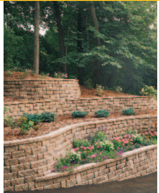
Jumper units break up the horizontal lines in this Highland Stone® installation. Use the estimating formula on the left to determine how many units are needed in a project.

Place an 18-inch-wide Highland Stone® unit on top of the jumper unit.