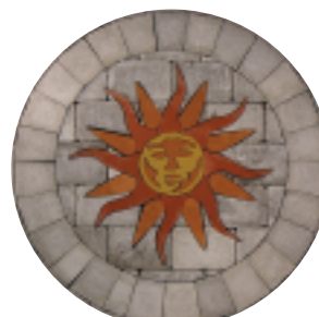
Sunburst* 4 ft circle