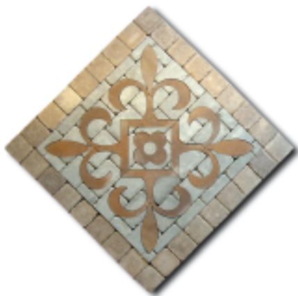
Renaissance 57" x 57"

These stock design kits combine subtle color combinations with tumbled pavers to achieve a rich and classic look.