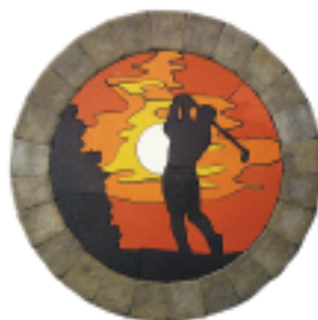
Golfer* 4 ft circle