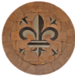
Fleur-de-Lis* 4 ft circle