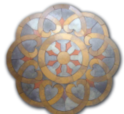
Rotunda 6 ft diameter