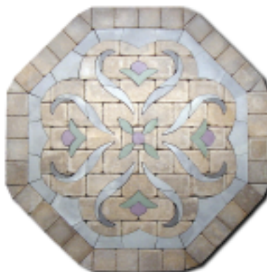
Florence 6 ft octagon