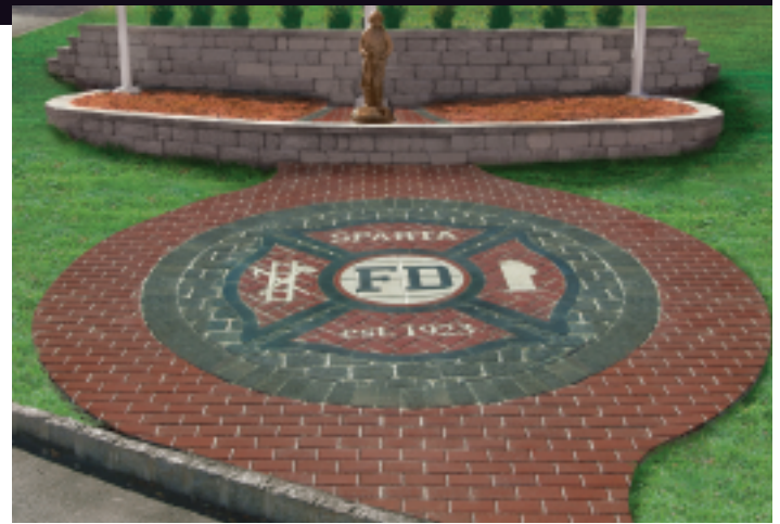
Streets, parks, memorials, fountains all come alive with our custom designs.

Paverart designs are crafted from high-quality concrete pavers that are colored through a special pigmentation process which are built to withstand the test of time. From walkways to driveways, patios to pool decks to larger commercial and municipal applications, your customers will be delighted with the distinctive and unique designs of Paverart. Grinnell offers the following Paverart stock designs, or your customers may take advantage of Paverart's custom design services which can transform almost any original design into a hardscape reality.