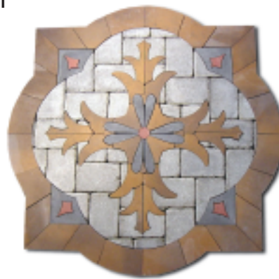
Acanthus 6 ft (arc to arc)