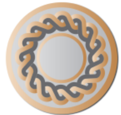
Sparta 5 ft circle